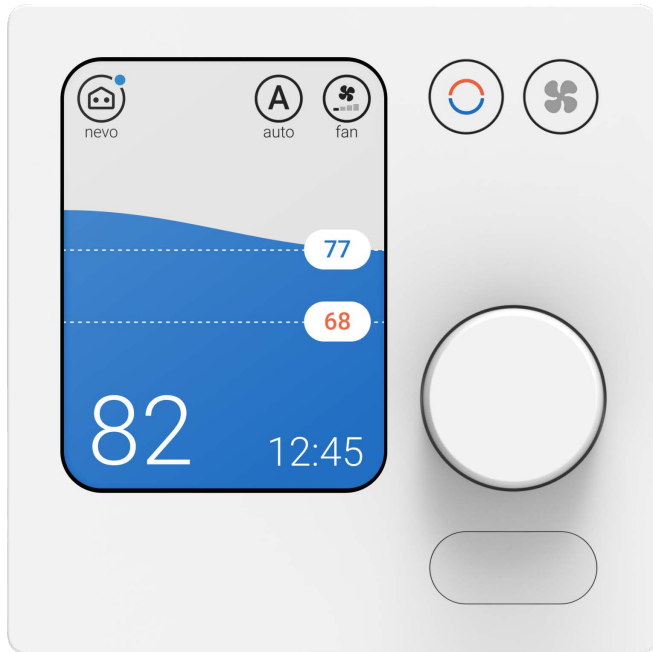
Image: Auto Mode Cooling