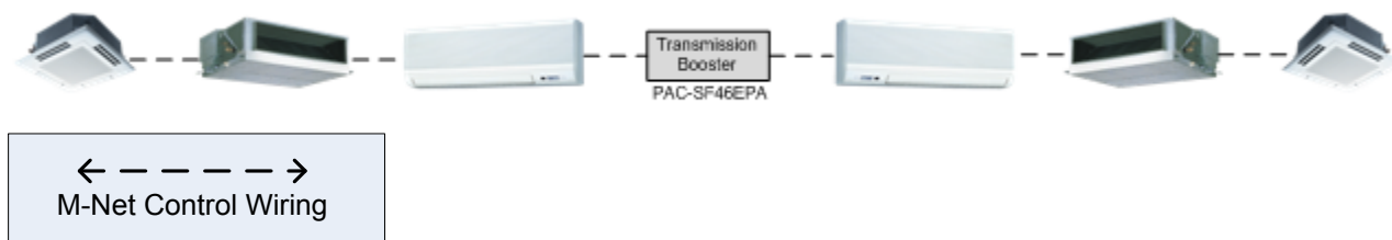
Figure 3: Unit configuration using Transmission Booster

The transmission booster is supported by Design Tool. We recommend using the Design Tool to assist with applying the transmission booster.