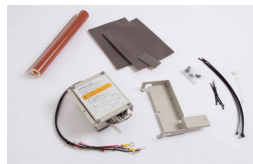
PAC-BH01KTT-E (Relay Box)