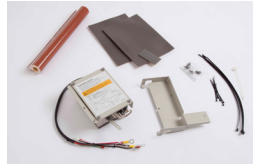
PAC-BH01KTT-E (Relay Box)